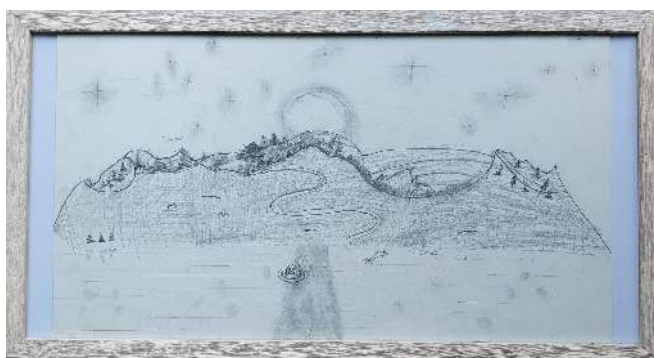
Losey Lothead-Usher - Kilmodan P4/5