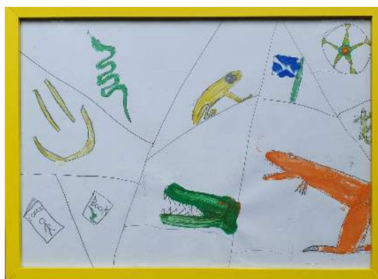
Torin Collier - Sandbank P5